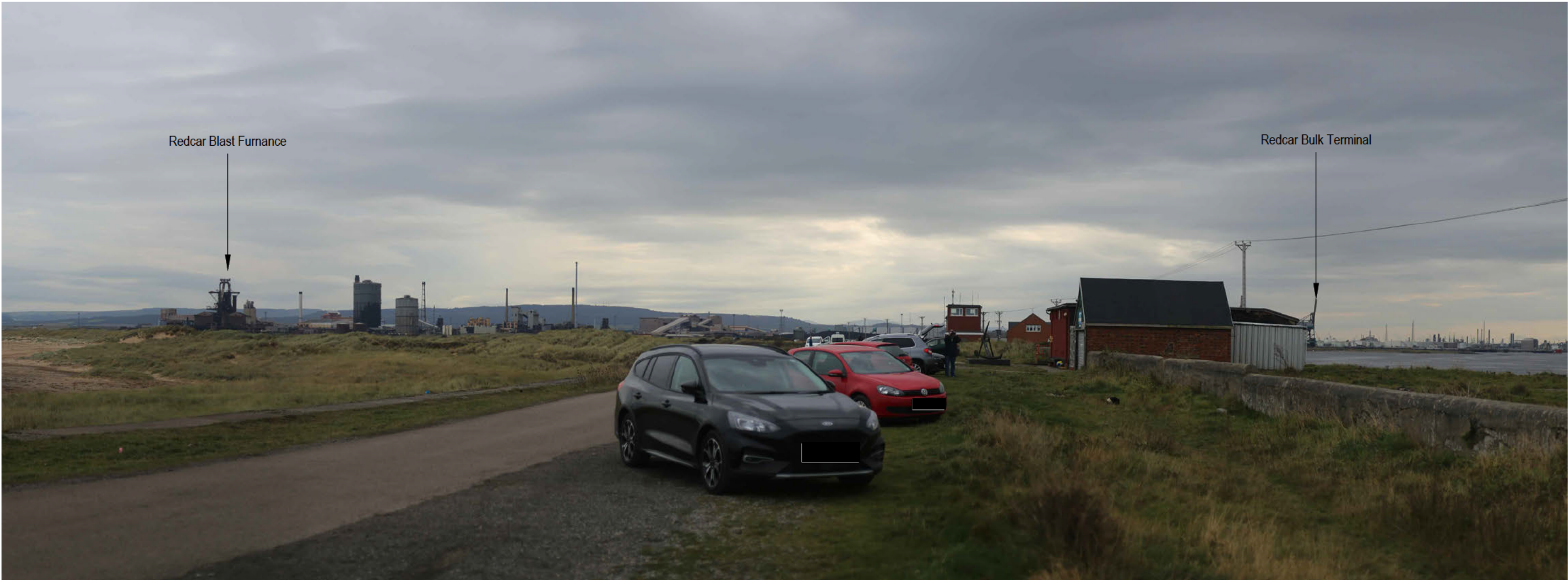
Extent of 50mm single frame image

PROJECT Net Zero Teesside CLIENT NZT Power and NZNS Storage